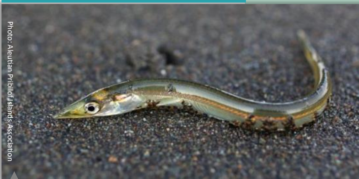
A pencil-thin sand lance finds refuge on a beach

Drift cells form and maintain beaches which provide recreational opportunities for people and important habitat for beach critters that support our iconic salmon and orcas. Structures like bulkheads alter the flow of sediments, limiting the formation of desirable beach habitat.